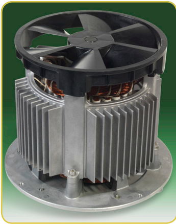
Hi-Cool heavy duty motor technology