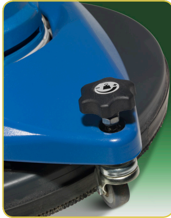
Simple load adjustment