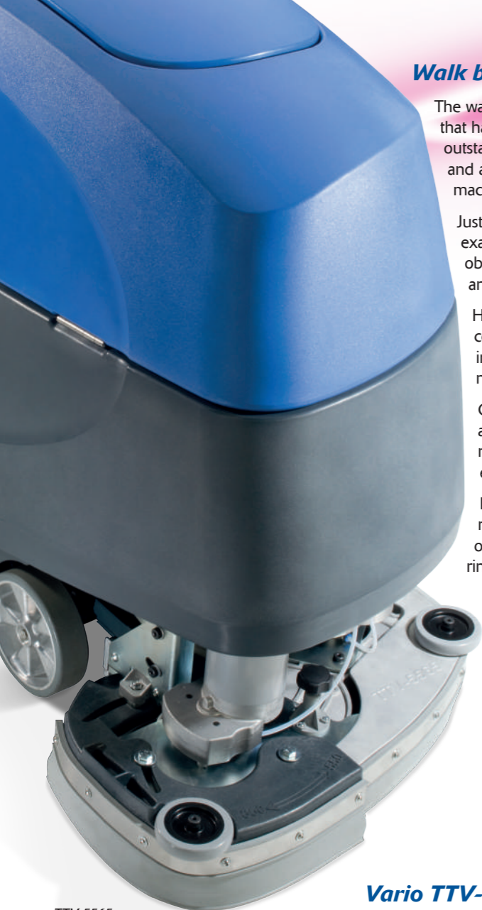
TTV-5565 in 55cm mode